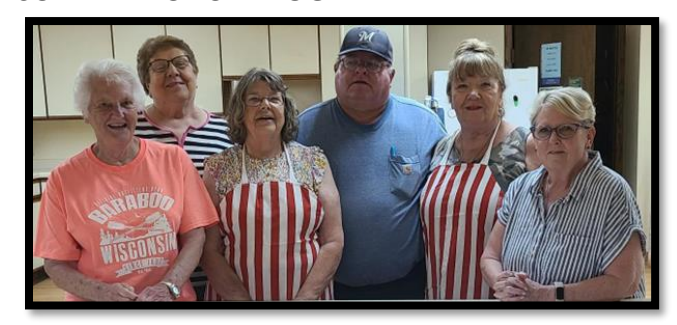
First Presbyterian Church Team Members

What a blessing the Summer Lunch Project was! We averaged 50 – 60 guests every day, with half being adults, and half children. The total number of meals served as of August 27 was 1,746, and that was with three more days to go! We are so thankful for every single person, group, and organization that donated their time, food, and skill to this project. It has grown exponentially since it's humble beginnings, and blessed many in our community.